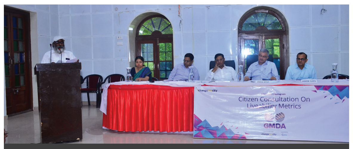
Citizen representative from Affordable Housing sharing the refined KPIs post the consultative discussion

Affordable Housing came up as a critical issue in the context of Gurugram, as the fast growing urban city with its high population density and limited availability of land is putting enormous strain on availability of safe, adequate and inexpensive housing for all. For the under-represented domestic worker, availability of housing around their area of work congruent with the income source was found to contribute to development of illegal slums and shanties. Towards this, a government enabled model of 'EWS Rental Housing' was suggested as a solution. Another important issue of 'Night Shelters' for the transient population was tabled since Gurugram sees a huge influx of people staying temporarily in the city but cannot afford the accommodations options currently available to them.