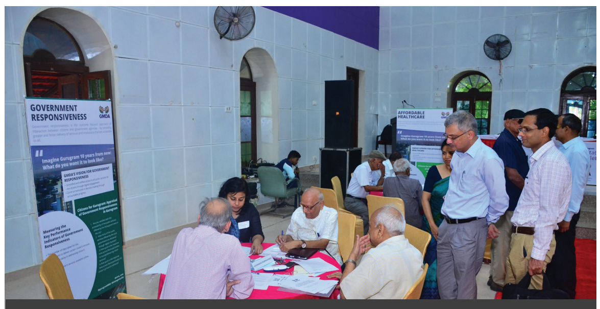
The focus group engaged in a discussion about best indicators of Government Responsiveness