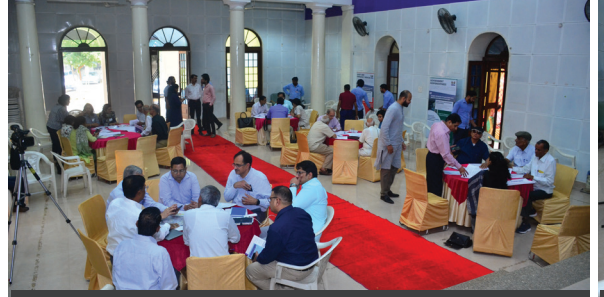
The morning session was organized as a breakout meeting for each thematic sector.

The morning session of the workshop was conducted as break-out meeting where citizens deliberated on one specific thematic sector of their choice. Each sector-based group was allotted one hour to consider the current draft indicators put out by the GMDA and arrive at the final set of indicators through dialogue and collective agreement. Citizen volunteers and staff from Janaagraha and Civis facilitated the discussion around each group, ensuring a Group Representative is nominated for the duration of the workshop to moderate and present the final outcome of discussion to the extended citizen collective. The workshop had participants across 9 sectors, except Power, Clean Energy & Piped Gas. Only a couple of citizens participated in Safety & Emergency Services, Education & Skill Development and Affordable Housing.