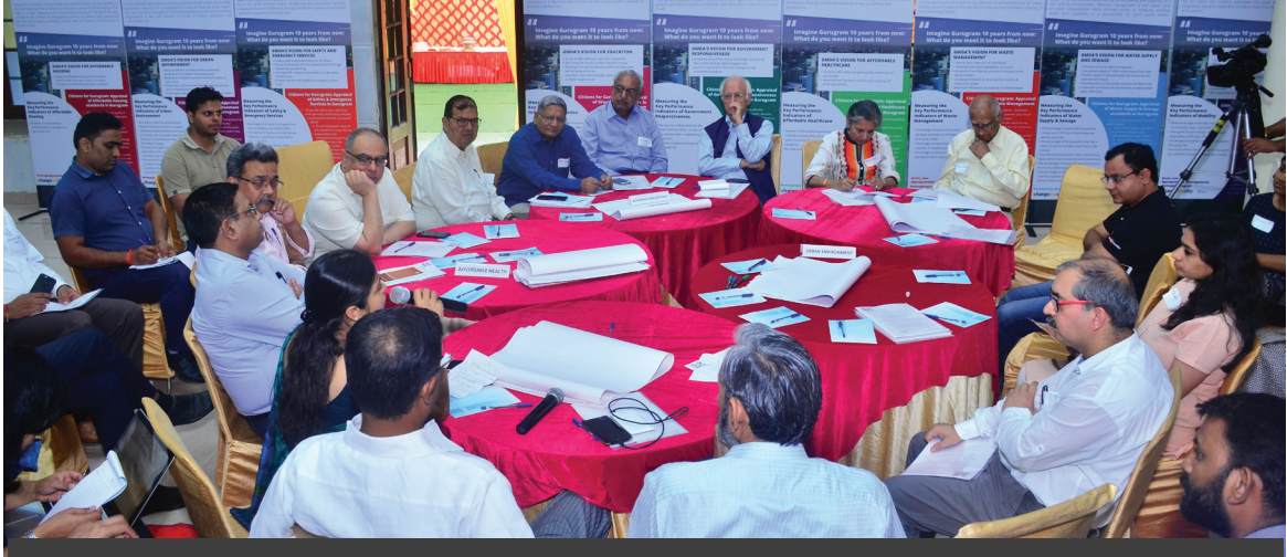
Sector wise display panels for providing reference points during the afternoon session

The afternoon session was organized as a round-table discussion to enable direct engagement with the GMDA and focus primarily on government responsiveness.