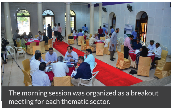
The morning session was organized as a breakout meeting for each thematic sector.

The morning session of the workshop was conducted as break-out meeting where citizens deliberated on one specific thematic sector of their choice. Each sector-based group was allotted one hour to consider the current draft indicators put out by the GMDA and arrive at the final set of indicators through dialogue and collective agreement. Citizen volunteers and staff from Janaagraha and Civis facilitated the discussion around each group, ensuring a Group Representative is nominated for the duration of the workshop to moderate and present the final outcome of discussion to the extended citizen collective. The workshop had participants across 9 sectors, except Power, Clean Energy & Piped Gas. Only a couple of citizens participated in Safety & Emergency Services, Education & Skill Development and Affordable Housing.