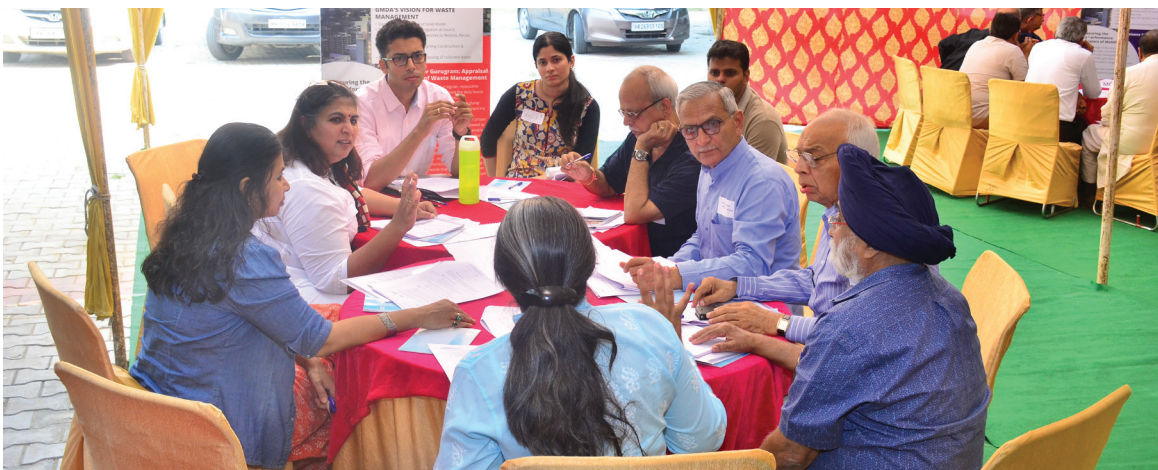
The issue of Waste Management drew in many concerned citizens to collaborate on finding solutions

The focus group on Waste Management found the current indicators to be insufficient in charting a roadmap for better management practices around waste in the city. The group was unequivocal about the need to develop indicators that allow for immediate course correction to achieve the goal of Zero Landfill Gurugram by 2030. The exigent need for enactment and enforcement of byelaws for collection, processing and recycling of various waste streams was emphasized upon. The group also expressed the need to create mass awareness campaigns around waste segregation and toxic repercussions of burning and dumping unsegregated waste in landfills including sanitary and e-waste; attributed to the large scale contamination of groundwater and all manner of air and land pollution. The discussion resulted in complete reworking of the initial set of indicators.