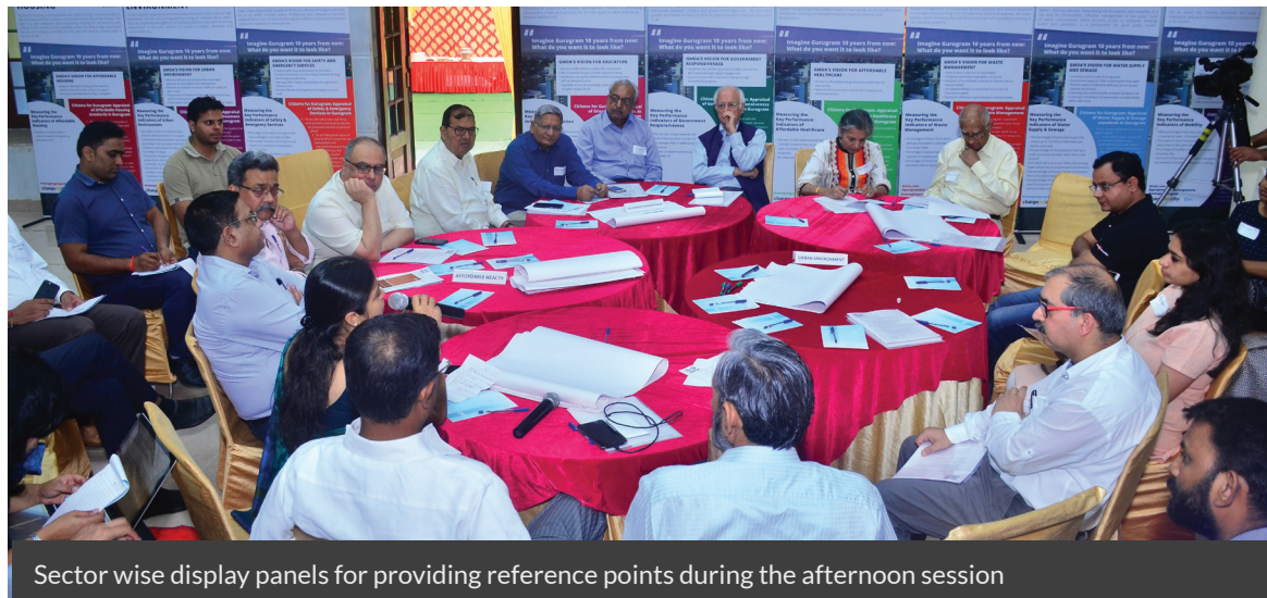
Sector wise display panels for providing reference points during the afternoon session

The afternoon session was organized as a round-table discussion to enable direct engagement with the GMDA and focus primarily on government responsiveness.