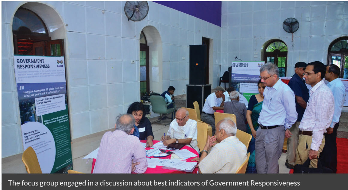
The focus group engaged in a discussion about best indicators of Government Responsiveness