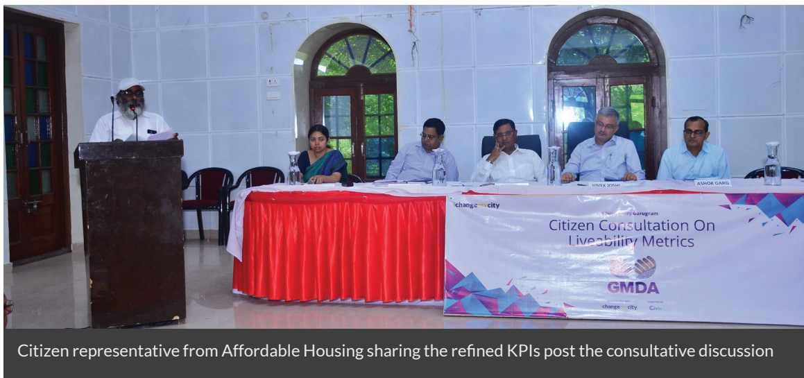
Citizen representative from Affordable Housing sharing the refined KPIs post the consultative discussion

Affordable Housing came up as a critical issue in the context of Gurugram, as the fast growing urban city with its high population density and limited availability of land is putting enormous strain on availability of safe, adequate and inexpensive housing for all. For the under-represented domestic worker, availability of housing around their area of work congruent with the income source was found to contribute to development of illegal slums and shanties. Towards this, a government enabled model of 'EWS Rental Housing' was suggested as a solution. Another important issue of 'Night Shelters' for the transient population was tabled since Gurugram sees a huge influx of people staying temporarily in the city but cannot afford the accommodations options currently available to them.